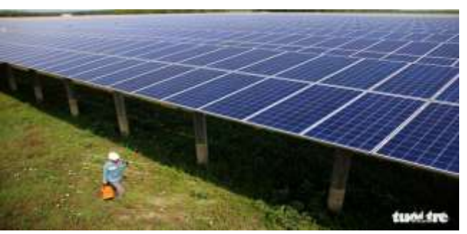
changes in technology prices of the market.

In addition, the price decision-making mechanism is limited in controlling the scale together with source and system development plan. At the same time, the price of solar PV power is difficult to reflect closely and promptly the